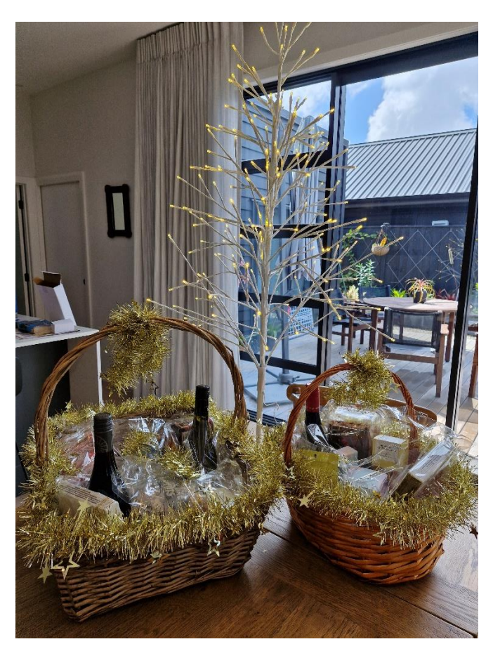
Don't forget to get raffle tickets for these fabulous prizes!

Just to get you in the Christmas mood – the Christmas Raffle gifts are ready to go: